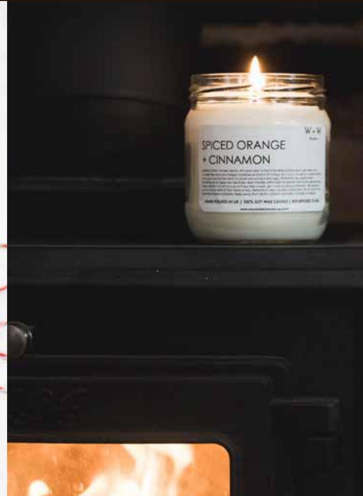
W+W Workshop Candle Making Workshop