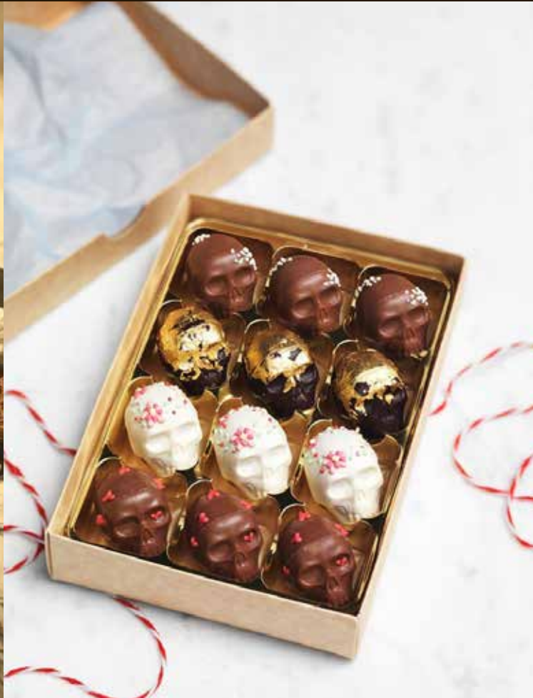
Diggle Chocolate Truffle Making Workshop