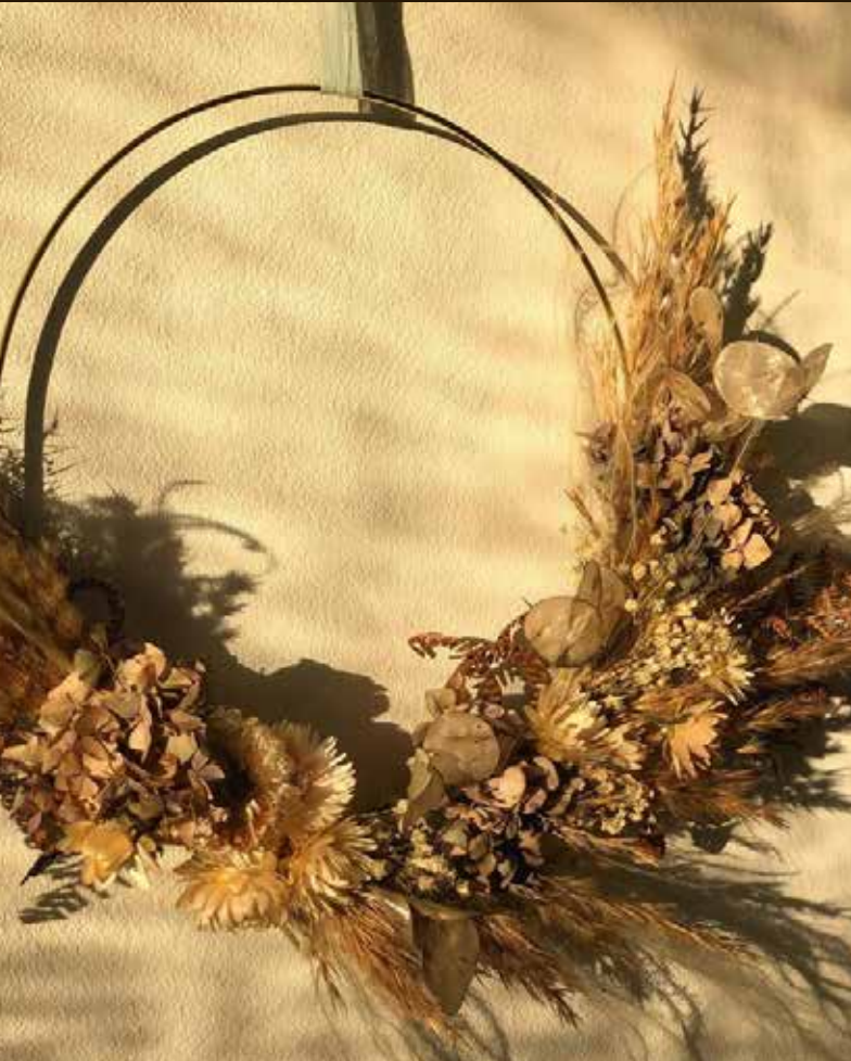
Florette Dried Flower Wreath Workshop